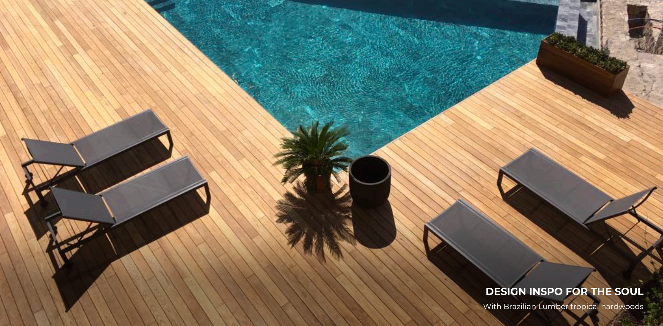
DESIGN INSPO FOR THE SOUL With Brazilian Lumber tropical hardwoods